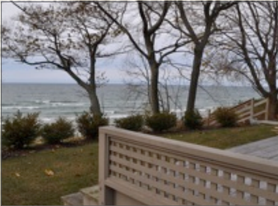
The roomy, newly built cottage is a 3-hour drive from Chicago or Detroit, and a 1-hour drive from Ford International Airport in Grand Rapids (GRR). Directions will be provided.